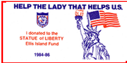
Statue of Liberty Fund donors received this bumper sticker.

Our first national service project was the Statue of Liberty fund. In 1984–1986, AIASA raised more than $50,000 to help restore